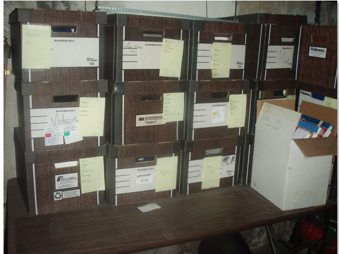
ThePhoto by PhotoAuthor is licensed under CCYYSA.